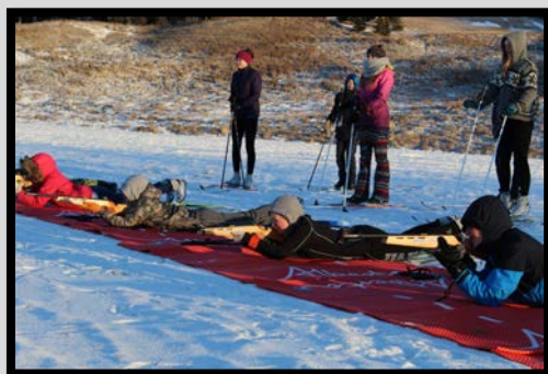
Alberta Biathlon & Wildcat Chaos!