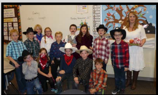
Celebrating the Wild, Wild West!

Millarville Community School 130 Millarville Road 403-938-7832 http://millarville.fsd38.ab.ca