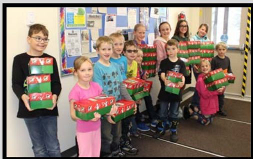
Shoe box donations made – Thank you!